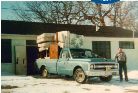
One of many trucks used by the Furniture Bank in its early years to help children and families in need.

The Furniture Bank of Southeastern Michigan was founded by a network of Birmingham and Bloomfield area volunteers and churches, incorporating as a non-profit organization in July 1969. It is the oldest furniture bank in North America, helping more than 65,000 families since its inception, evolving over time into an organization of caring professionals committed to helping local families in need.