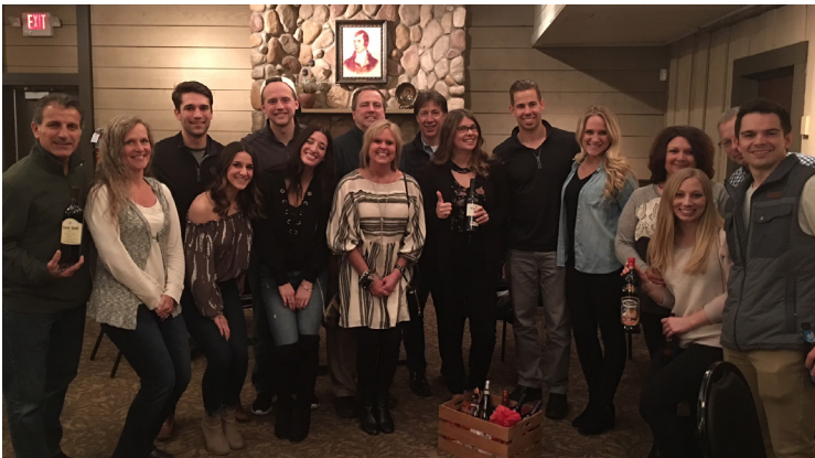
Fun was had by all who attended this year's Euchre Party & Game Night, which raised about $5,000 for Furniture Bank programs.

More than 100 attended the event, which raised nearly $5,000 to provide beds and furniture to local families in need. Many thanks to presenting sponsor, Gleba & Associates, Inc., and sponsor Patricia E. Kefalas Dudek & Associates.