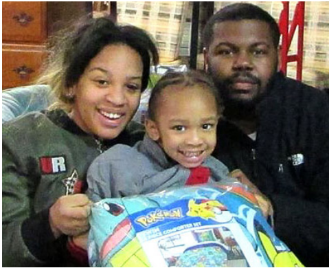
One of the services offered by the Furniture Bank is the “Bedding for Kids” program. Many thanks to the volunteers and donors who make this program happen for our families.